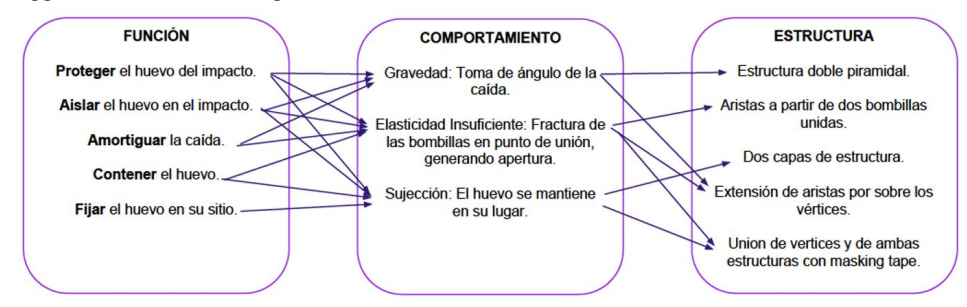
Figure 1 Example of the FSB Ontology applied by students to the "egg challenge" design problem.

The systematization of information extracted from the research products developed by the students, that is, posters, presentations, reports based