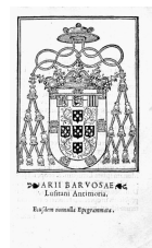
Figure 1. Title page of Antimoria (1536) by Aires de Barbosa (1456-1530). Printed in Coimbra by Canons Regular of the Holy Cross this was the first book printed in roman typefaces.