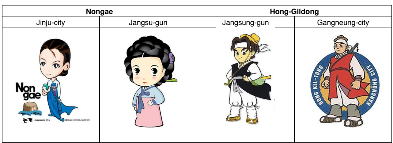
Table 2 - Same figures manufactured from different regions

When the characters are based on historical figures, the different regions may argue over who will take over whom. In the case of Nongae and Hong-Gildong, each of them were created by different regions. These are just a few examples and there are many more similar cases.