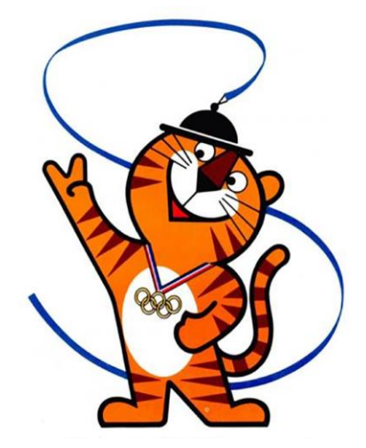
Fig. 1: The mascot for the 88 Seoul Olympics,

ages. Thus the medium for cartoons made a transition from paper to computer, and characters also underwent a change from being 'analog' to 'digital'. In a nutshell, the development of technology made character design possible.