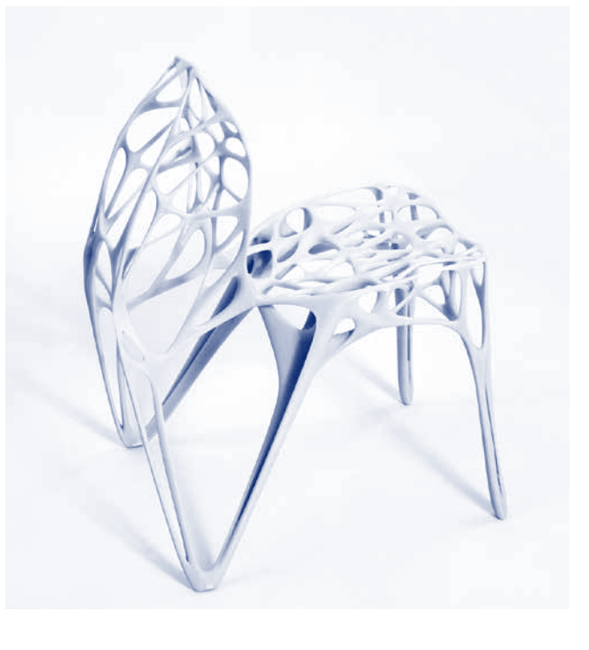
Figure 3: 3D-printed Generico chair, scale 1:1.