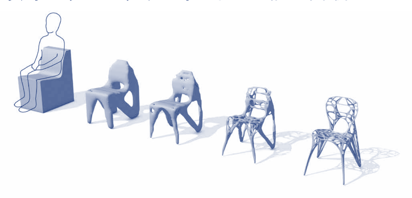
Figure 1: Form-finding process through topology optimization.

Therefore the loads and the positions for the supports were defined as boundary constraints for a topological form-finding calculation, using Solid Thinking Inspire . The topology optimization generated an ideal material layout for the given conditions while also reducing local stresses and maintaining structural stiffness for the design. In an iterative process the calculation resulted in a reduction of the necessary material to meet the performance requirements.