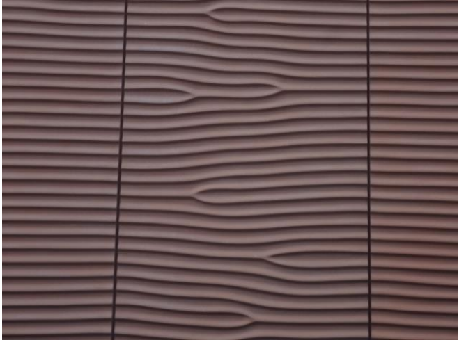
Figure 1: Panels pattern texture inspired on desert sand waves. Date: 2016.

The structure of the pavilion is a steel frame covered with Glassfiber Reinforced Concrete (GRC) panels, a common material in civil construction used in a different way. The texture of all panels had ripples that are inspired on the desert's sand pattern, and the shape of the canyon panels are curved, giving a similar effect as standing in the middle of this canyon-like scenario.