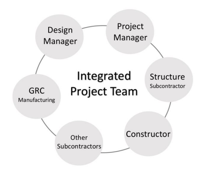
Figure 2: Integrate team for UAE Pavilion. Font: Project Manager diagram. Date: June, 2016.

Design Manager: A United Kingdom firm, Fraser and Randal, is directly connected with the client and architectural design team. This enterprise has extensive experience managing complex projects; contents such as graphics, media, interaction and environment; design, clarifying, and structuring, organizing, briefing and feedback; procurement, searching better suppliers; managing construction; cost and construction design. Here, they are responsible for Manager, monitoring the entire process, qualifying the partners, supervising costs and evaluation process and quality survey, organizing meetings, communications, qualifications of suppliers, revision and approval of all drawings, deadlines and services.