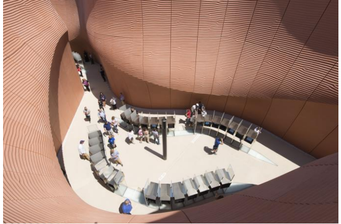
Figure 2: Canyon. Photo Nigel Young + Foster & Partners.

This is a complex building with many details and solutions, from the architecture design, interactive exhibitions, structure, substructure, different kind of curved and flat panels, junctions, technological 3D projections, extensive program, facilities, etc.