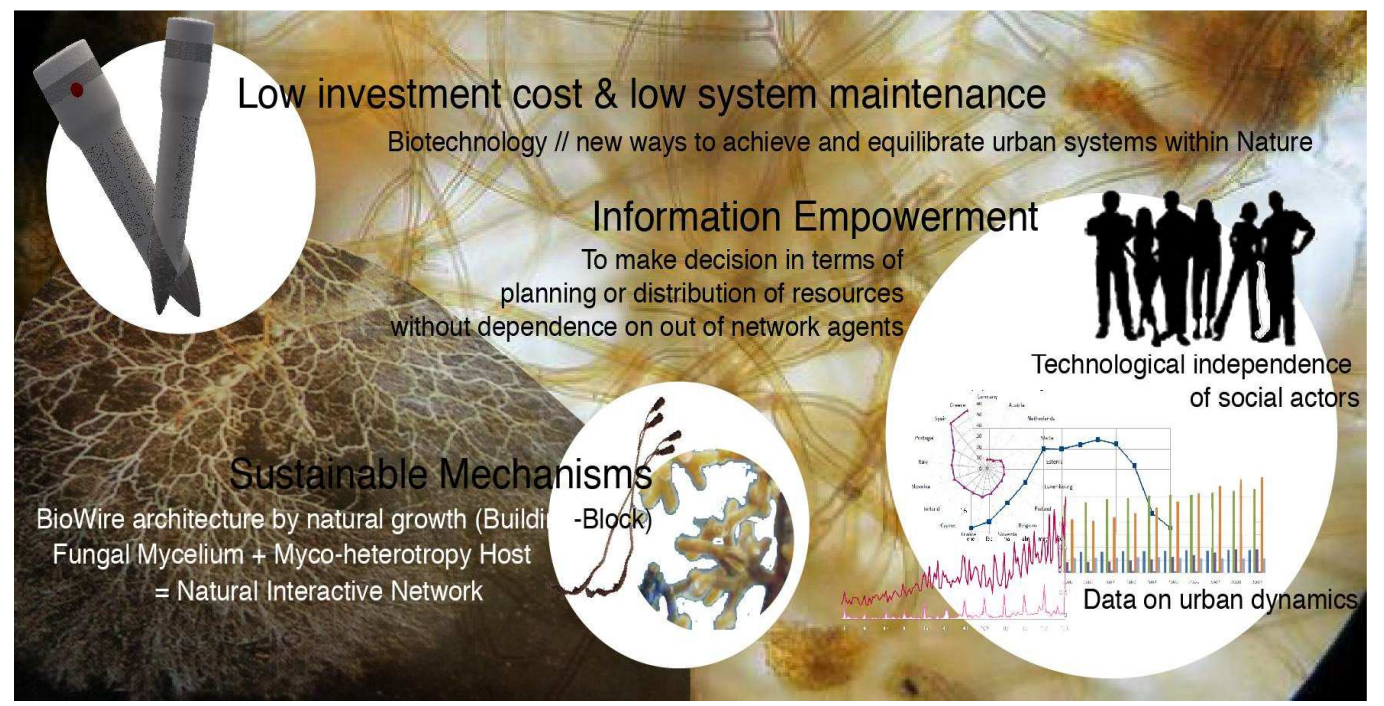
Figure 2: Environment Benefits

The differences in conditions and changes in the ratios, will work like as triggers to spark a signaling reaction to be read.