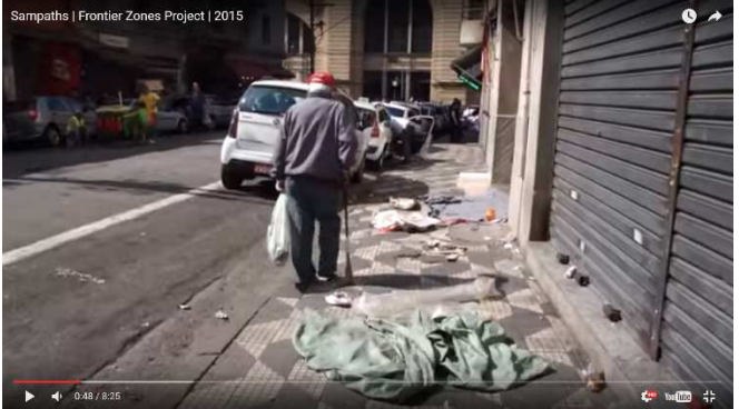
Figure 3: Obstacles on sidewalk, garbage, risk of accident for disabled man; sequence 0:48