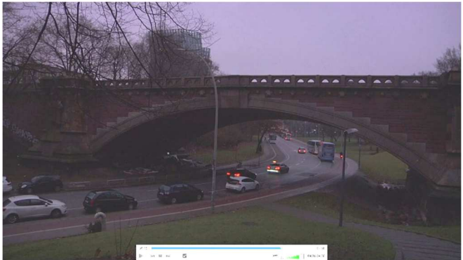
Figure 12: Homeless camp under the Kersten-Miles Bridge at night, with the "dancing towers" (high rises) along the Reeperbahn visible in the distance; sequence 4:01