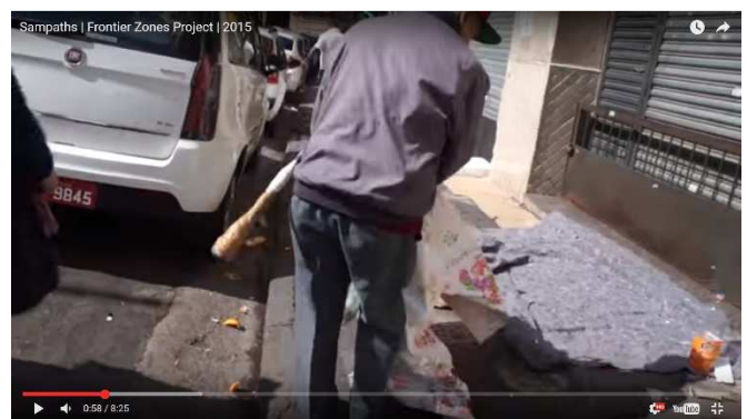
Figure 4: Protagonist is searching for valuables, shows no respect for stranger who appropriated the space; sequence 0:58