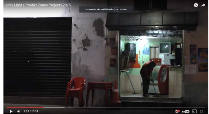
Figure 8: right: a store opening up; left: store still closed; sequence 1:55

The students in Germany attempted to capture the awakening along the Reeperbahn Hamburg and used early-morning deliveries to present an analog scene. The still deserted street is used to get work done to the greatest extent possible without being seen and without infringing any more than necessary on the utilization of public space. These laborers are invisible to the "normal" working population. The strict division of labor segregates the working population - something that cannot be identified in the scenes shot in São Paulo.