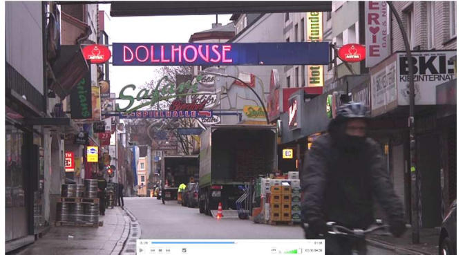
Figure 9: Deliveries near to the Reeperbahn in Hamburg; sequence 2:38

The next step was to show Brazilian life in São Paulo in an informal settlement (favela), framed by the high rises of the formal city. The atmosphere of the settlement appears almost cozy in comparison to the anonymous big city peering from above at those "down there." The spatial boundary is identical to the social and economic boundaries. Looking at other scenes offers insight into daily life in the settlement: children playing on the street, people getting their hair cut or listening to music.