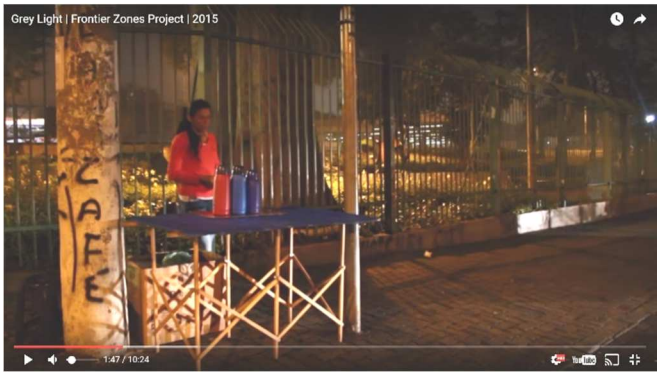
Figure 6: Street vendor, mobile coffee stand; sequence 1:47

The following scenes are from film no. 3. "Greylight." The assumption is that this middle-aged woman is selling coffee in the early morning. The word "Café" can be seen on the column. The woman may have sprayed the word on the column herself, which leads to the assumption that she peddles coffee here regularly. How her business works is not apparent: e.g. from where does she get new coffee, or does she stay only until the coffee she brought with her is sold out. Whether this stand is legal and whether it offers the vendor protection or a place to sit down is not evident.