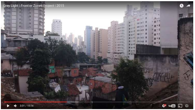
Figure 10: Favela in the foreground, surrounded by high rises; sequence 3:31

The next step was to show Brazilian life in São Paulo in an informal settlement (favela), framed by the high rises of the formal city. The atmosphere of the settlement appears almost cozy in comparison to the anonymous big city peering from above at those "down there." The spatial boundary is identical to the social and economic boundaries. Looking at other scenes offers insight into daily life in the settlement: children playing on the street, people getting their hair cut or listening to music.