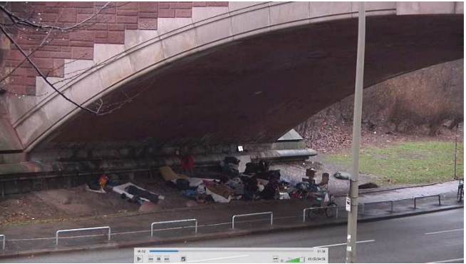
Figure 11: Homeless camp under the Kersten-Miles Bridge near the Reeperbahn, Hamburg; sequence 3:45

One does not find informal construction of residences in Germany in the way that it is present in many places throughout South America, but the homeless still appropriate space in public spaces. Because it offers protection from rain, the space under bridges is often used to establish permanent camps. The group camp shown here is centrally located and is normally visible only from passing vehicles. There are very few pedestrians and the traffic noise is substantial. Persons of meager means are alienated from the rest of the population. As in Brazil, the mood is cozy sometimes, like when music can be heard.