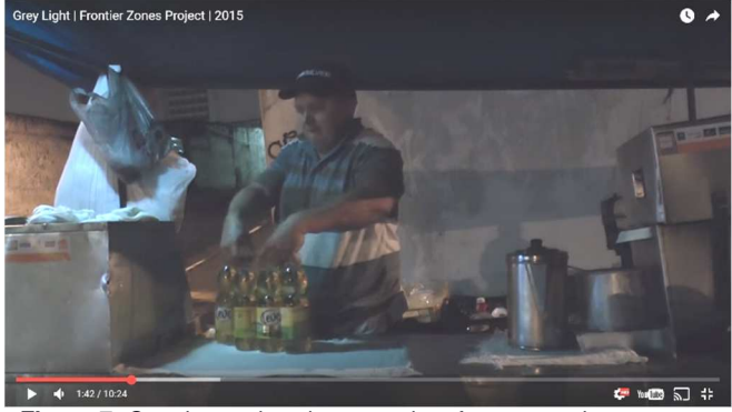
Figure 7: Opening and setting up a shop for street sale; sequence 1:42

The scenes in Figures 7 and 8 are of a street with a multitude of small shops, showing the businesses being set up for the day. The persons working here come from a social background of the gainfully employed. After sunrise, the same people assume the role of vendor. In the progression of street stalls, the street vendor has the inferior stand.