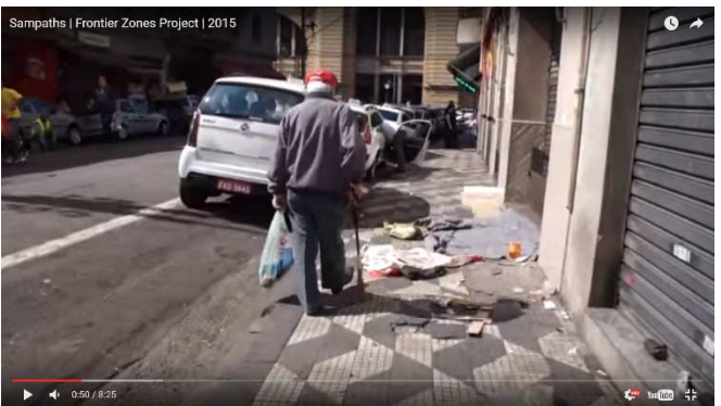
Figure 2: Appropriation of space, place to sleep, protagonist; sequence 0:50