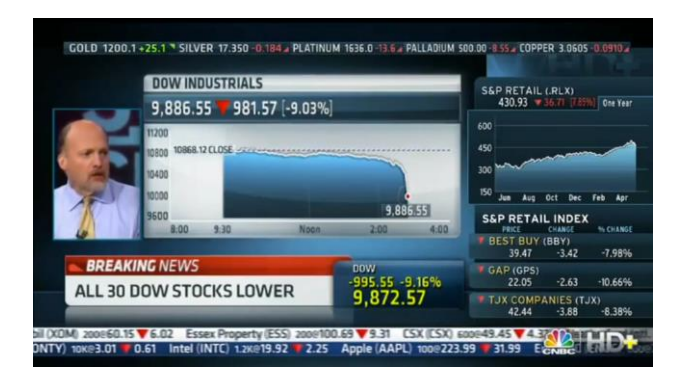
Figure 1: CNBC live coverage, Flash Crash Capitulation, 2010

With competition intensifying in this segment, too, what appeared are schemes that distort competition directly on the level of market infrastructure (for instance, the so-called order type controversy). As will be shown below, some market centers supported (and apparently still do) "regulation arbitrage:" with the growing number of exchanges – profit-seeking corporations fighting for market share, rather than public institutions – the exploitation of regulation asymmetries has become thriving business for traders in the know (which are frequently shareholders of these very market centers). Market activity increasingly borders on, or is already on the paths of, illegality.