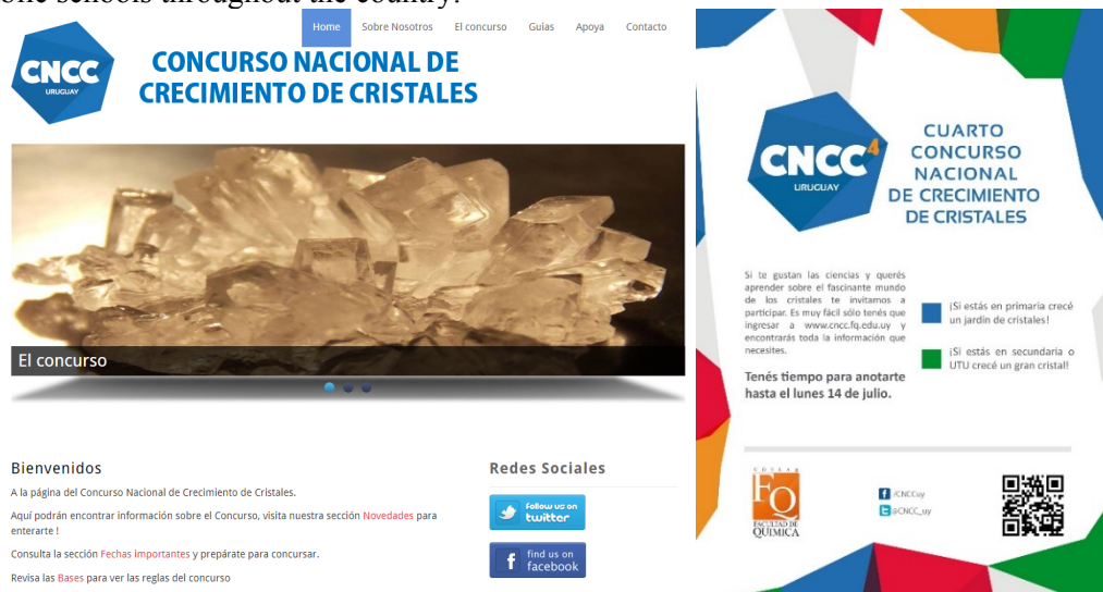
Figure 1. CNCC webpage and 4 th edition poster.

The organization of the event was done by the International Year of Crystallography Work Group of the Facultad de Química, Udelar. In this stage aims, categories and timelines were set, financial aid and sponsorship was requested and graphical identity and broadcasting material designed. During the first months of the school year posters with the information on how to participate were distributed in paper and via web in social media and the webpage of the CNCC. Also, members of the organizing committee who normally participate in outreach activities on the National's Science and Technology Week took the opportunity to spread the contest. Afterwards, interested tutors must undergo a questionnaire to demonstrate their crystal growth knowledge to be able to present participating groups using audio-visual aids developed by the organizers and made available on the webpage, in order to substitute the hands on workshops given in the first two editions. Once they pass the questionnaire they are allowed to enrol student groups and apply for some support consisting of the substance to grow a single crystal. When obtained, depending on donations and financial aid acquired each year, materials are distributed to public schools throughout the country.